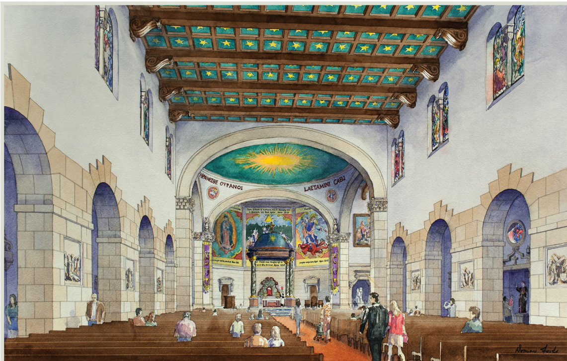
PROPOSED INTERIOR DESIGN RENDERING