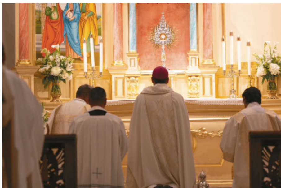
Adoración al Santísimo Sacramento