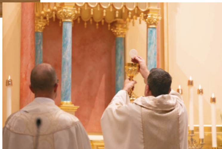
Adoration of the Blesses Sacrament