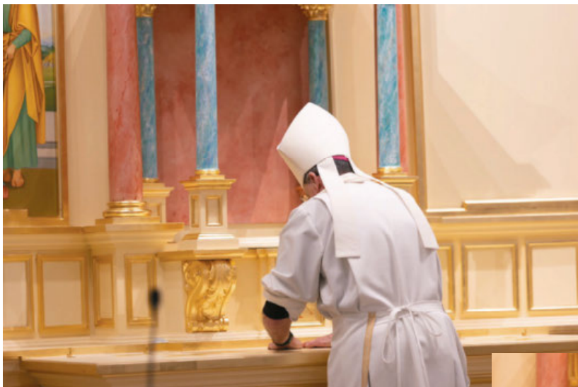
Anointing of the Altar with Chrism Oil