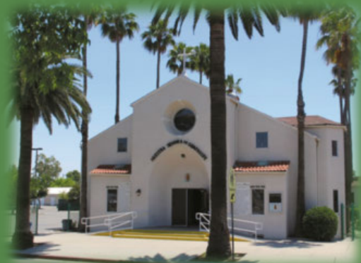
PARISH CHURCH / IGLESIA PARROQUIAL 601 E. California Ave., Bakersfield, CA 93307