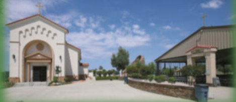
SHRINE/PAVILION / SANTUARIO/ PABELLON 4600 E. Brundage Ln., Bakersfield, CA 93307

PERPETUAL ADORATION OF THE BLESSED SACRAMENT BETHLEHEM CHAPEL/CAPILLA DE BELÉN