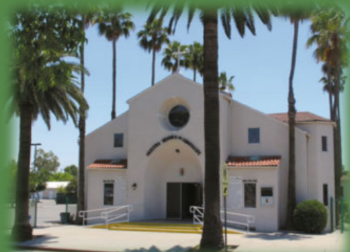
PARISH CHURCH / IGLESIA PARROQUIAL 601 E. California Ave., Bakersfield, CA 93307

DAILY MASS: Tuesday/Thursday 7:00am MISA DIARIA: Lunes/Miércoles/Viernes 7:00am SUNDAY MASS: Sat. Vigil 5:30pm Sun. 6:45am, 10:00am, 6:30pm MISA DOMINGO: Sábado Vigilia 7:00pm Domingo 12:00pm