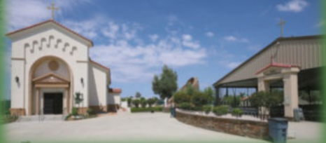
SHRINE/PAVILION / SANTUARIO/ PABELLON 4600 E. Brundage Ln., Bakersfield, CA 93307

PERPETUAL ADORATION OF THE BLESSED SACRAMENT BETHLEHEM CHAPEL/CAPILLA DE BELÉN